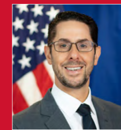
Amir Masliyah Minister Counselor of the U.S. Embassy in Paraguay

“For the past 3 years the U.S. government has supported an alliance between UNA and Rutgers University to strengthen the culture of lawfulness in Paraguay. From the academic sector this alliance seeks to ensure that higher education not only transfers knowledge and technical skills but also values such as transparency, ethics and equity.”